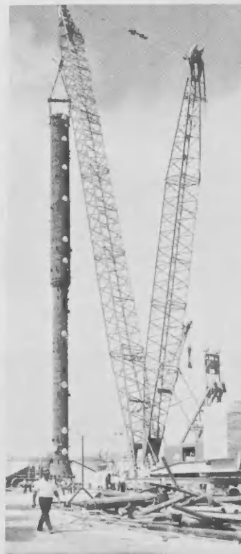
Fingering the sky here are the V-shaped boom and mast of the Manitowoc Crane setting one of the catacarb towers in place.